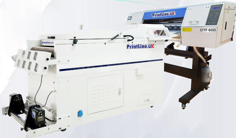
-DTF Printer by Audley 60cm with automated shaker