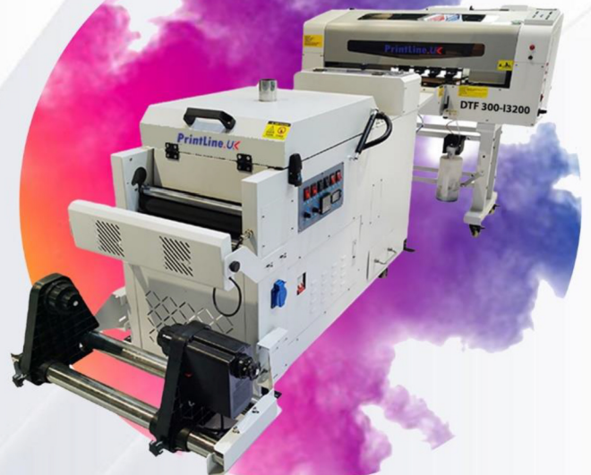
-DTF Printer by Audley 30 or 45cm with automated shaker